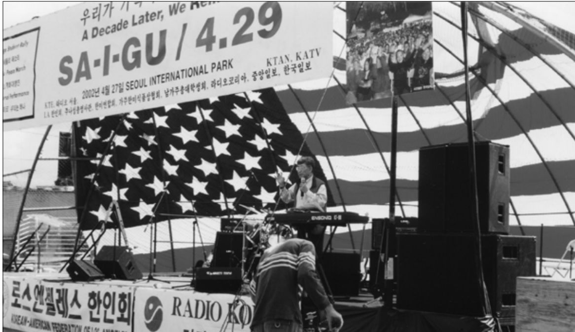
Photo: K.W. addressing the huge crowd that packed Seoul International Park in the heart of Koreatown during the 10th anniversary rally of the 1992 Los Angeles Riots.

“My new liver may have belonged to an African American or a Latino or an Anglo. What does it matter? We are all entangled in an unbroken human chain of interdependence and mutual survival.”