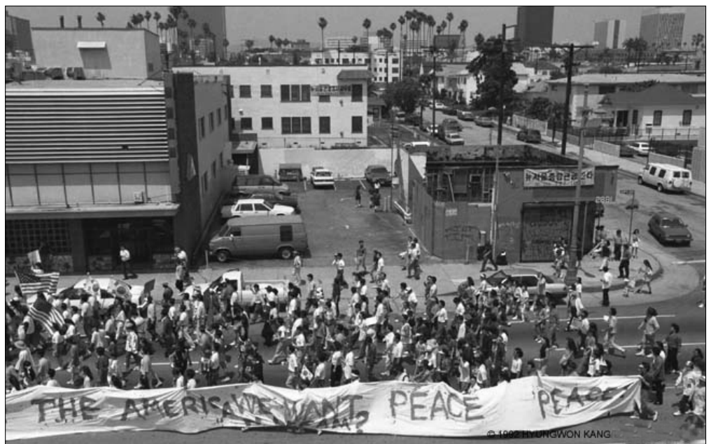
Photos: top, Korean-owned shops burn during the 1992 Los Angeles Riots in Koreatown, April 30, 1992. Right, hundreds rally for peace in Koreatown.