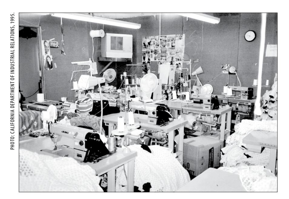
Photo: El Monte sewing room, Los Angeles, California, 1995. The El Monte sweatshop operators used the first floor rooms of the apartment complex for sewing operations.

"When I got on the plane to come to America, I was so excited. America was the land of dreams. I wanted to work hard and better myself, give my family a better life, and I wanted to see this beautiful country."