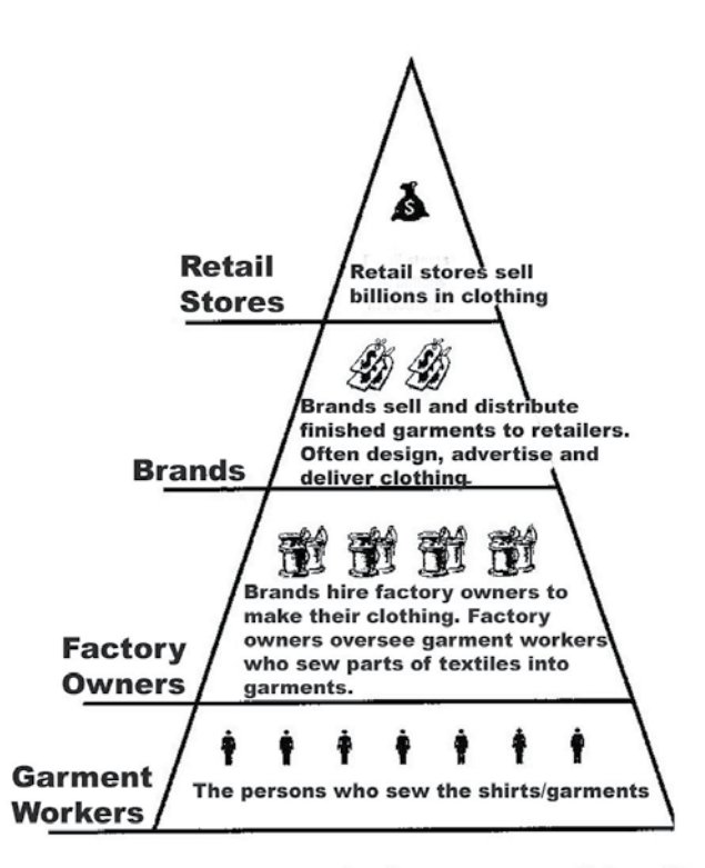
Pyramid of Power and Profit