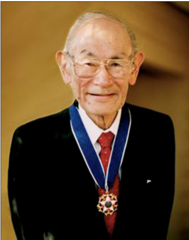
Photo: Fred Korematsu wearing the Presidential Medal of Freedom

the Supreme Court during World War II. The coram nobis rulings also became widely publicized, undermining the widely held view that Japanese Americans were disloyal. In 1988, after intense community organizing and political lobbying, the 100 th Congress passed the Civil Liberties Act, authorizing reparations and mandating a national apology. The apology, sent to each internee in a letter from Presidents Ronald Reagan and George H.W. Bush, read: