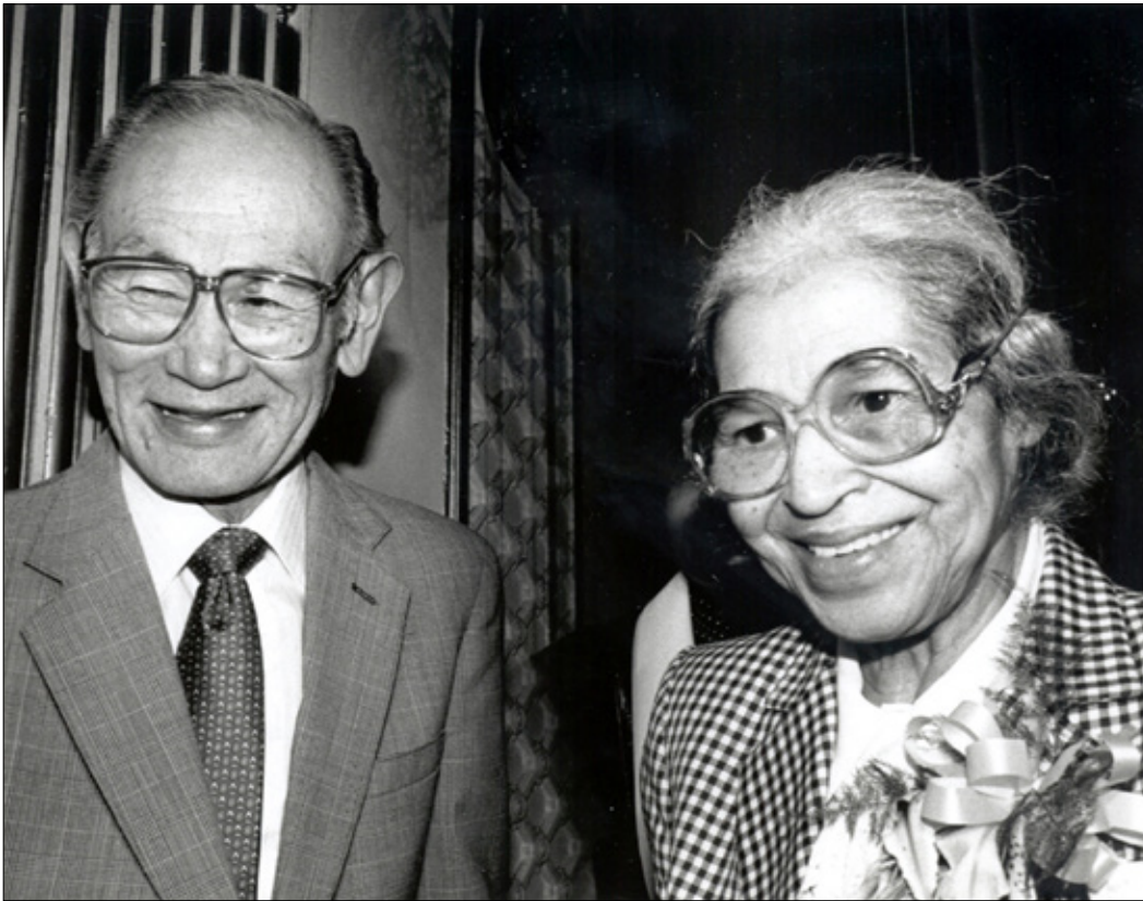
Photo: Fred Korematsu and Rosa Parks at ACLU of Northern California Bill of Rights Day.

military commander, whose views were seriously infected by racism.