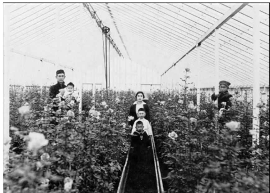
Photos: this page, Fred Korematsu as a child inside the family’s rose nursery. Opposite page, Fred and family, circa 1939.

With his Caucasian girlfriend, Fred planned to move inland to Nevada. He sold his car, threw away his California driver’s license, and on his draft card